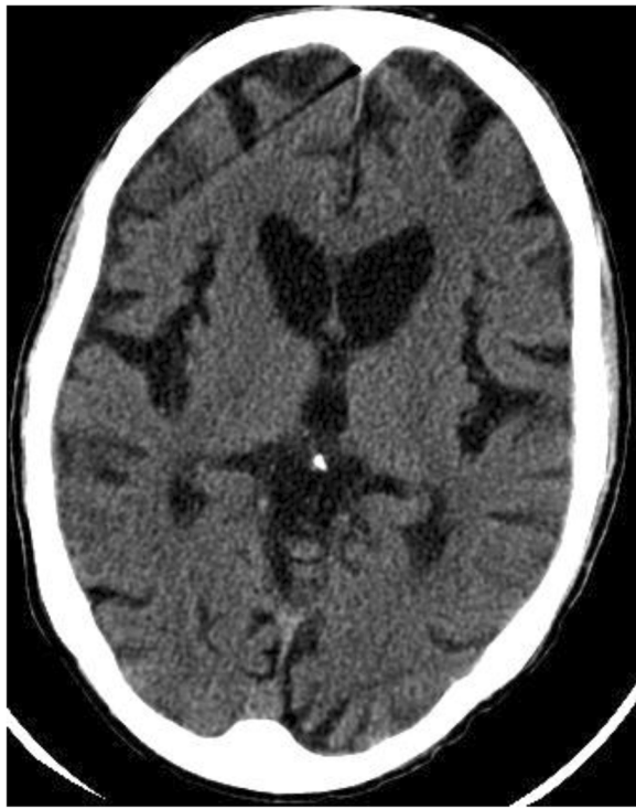
Fig. 2 Brain CT scan of Patient III-7 showing generalized cortical atrophy and atrophy of the head of the caudate nucleus

family member that when the patient first began showing movement disorder symptoms he would arrive for work at 4:00 a.m. rather than 6:30 a.m. This reported behavior is consistent with cognitive decline, specifically executive dysfunction affecting planning and decision-making [29].