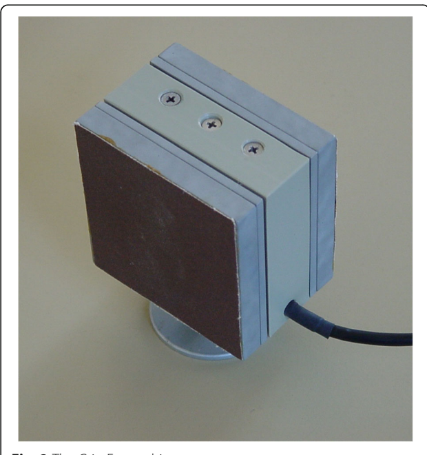
Fig. 2 The Grip Force object

In these tasks, a metal block with integrated force and acceleration sensors and a total weight of 306.5 g (see Fig. 2: The Grip Force object. W \times H \times D: 65 \times 65 \times 50 mm) was used. Similar objects have been used in several studies by Hermsdörfer et al. [29]. We